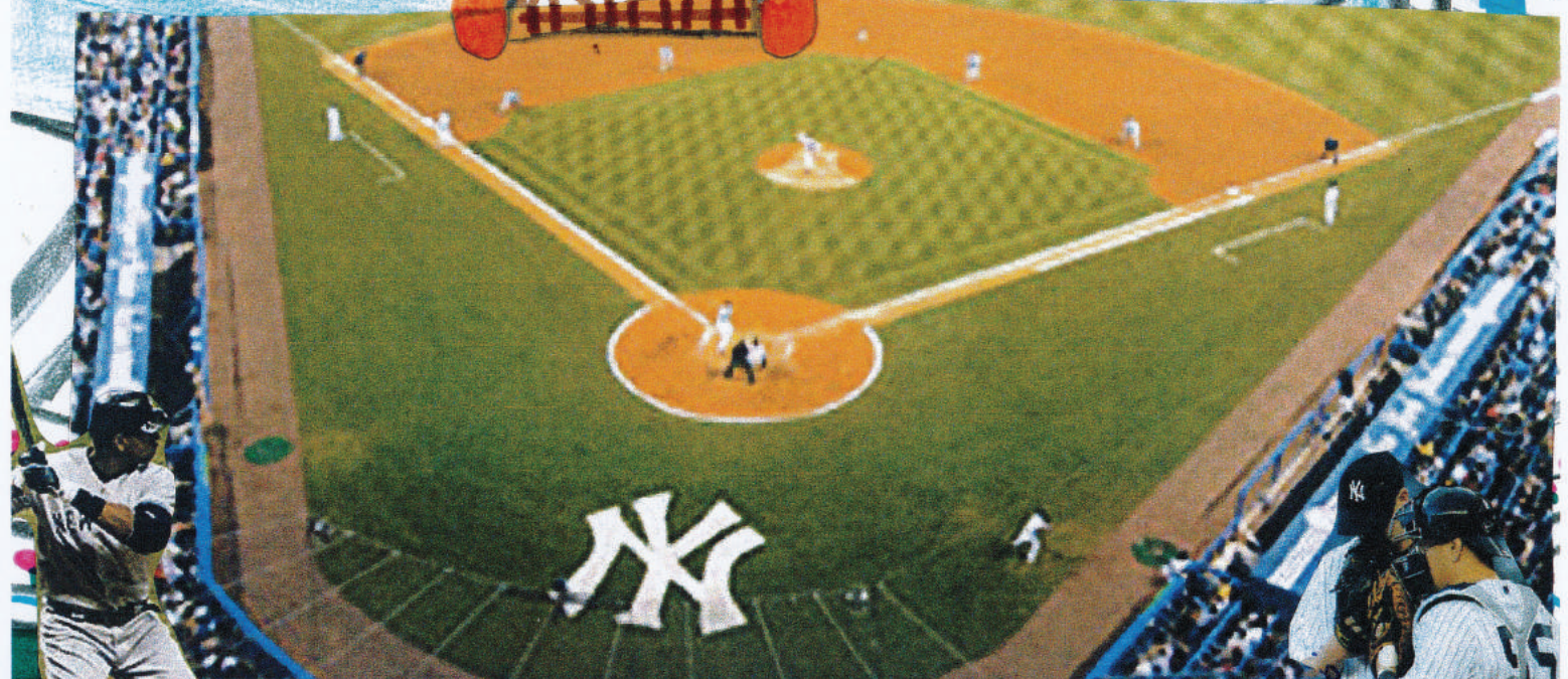
Mamie Fashion a embarqué à bord d'une montgolfière depuis le Pérou en direction de la « Big Apple » : New York. Au beau milieu d'un match des « Yankees », « players and spectators » regardent stupéfaits une motngolfière atterrir sur le terrain.